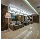
› MFC Capital City