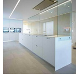
› Vivienda ático